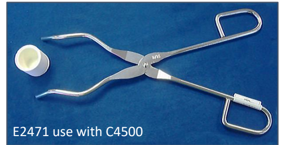
E2471 use with C4500

Typically used with ceramic crucibles. Long and wide handled; allows for use of heat protective gloves.